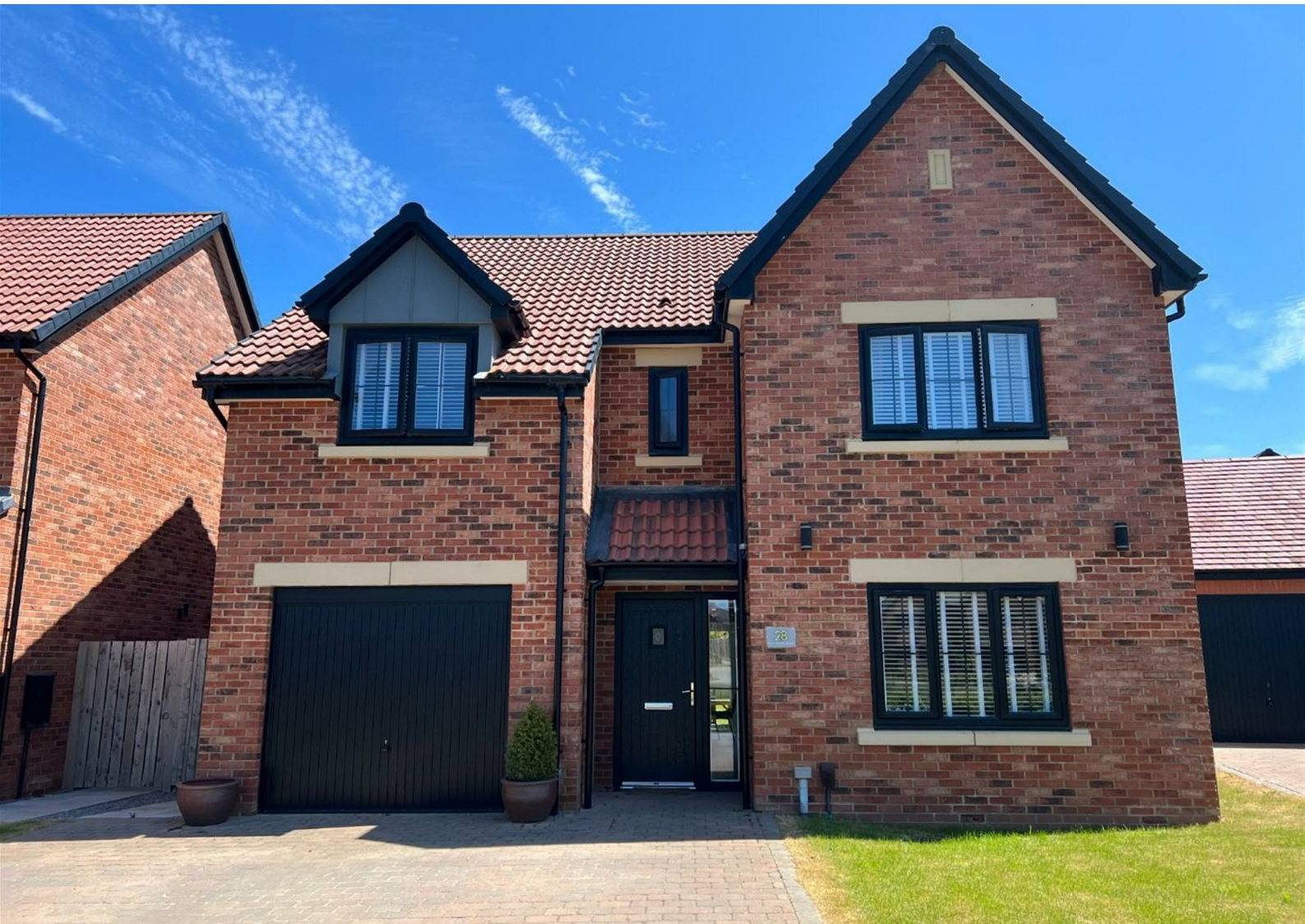
Wynyard Village | TS22 5TT